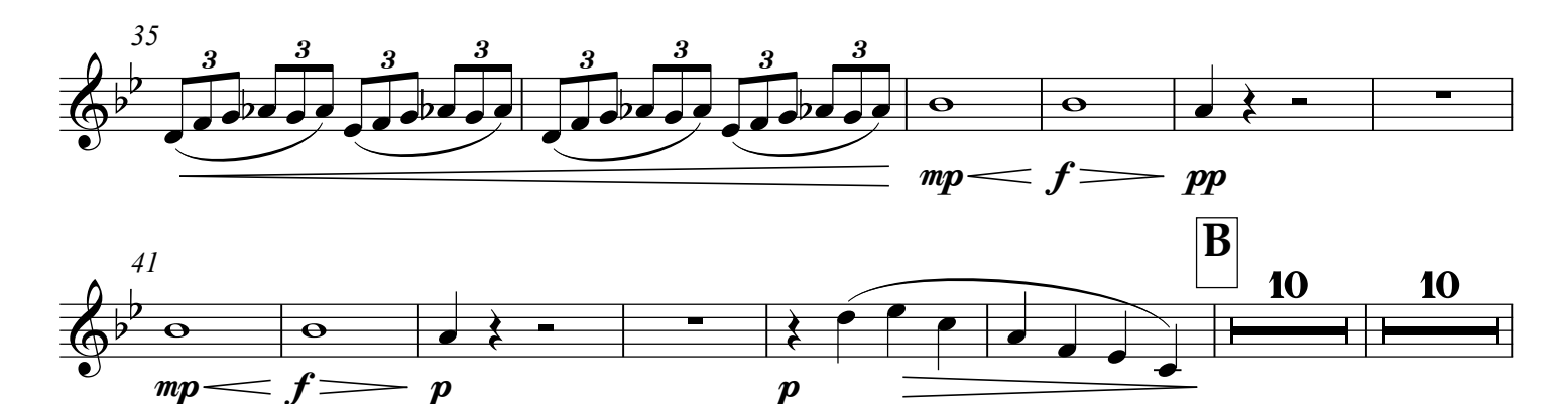
This arrangement © 2006 by Martin Tousignant. All rights reserved.